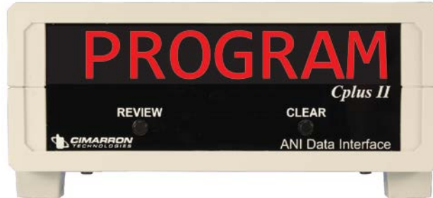
C Plus in PROGRAM Mode

When Using Hyperterminal, characters you type will not be visible on the computer display.