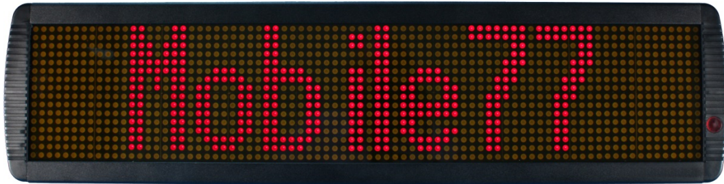
Model ACC-Wall, P/N 01 30 1680